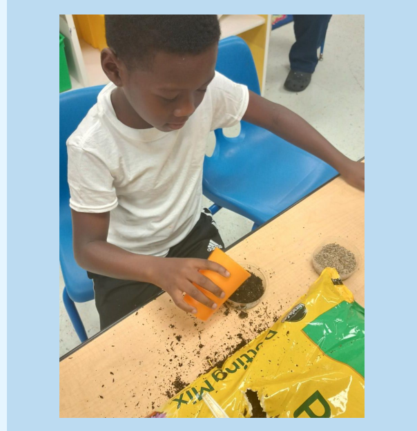
The Botanical Gardens